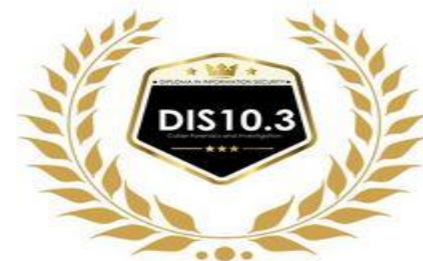
DIS10.3 Cyber Forensics Investigation