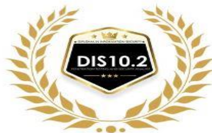
DIS10.2 Penetration Testing and Security Analyst