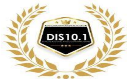
DIS10.1 Ethical Hacking Countermeasure

Ethical Hacking course provides the in depth knowledge of the Security concepts on various best tool sets, techniques, exploits and explains how an ethical hacker can be beneficial to the company. Courseware of DIS is been designed by world top ethical hackers and Cyber Security Consultants.